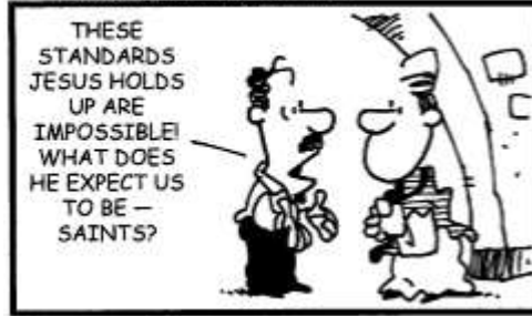
7TH SUNDAY IN ORDINARY TIME