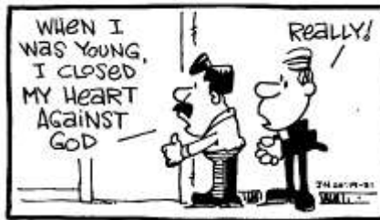
2 ND SUNDAY OF EASTER